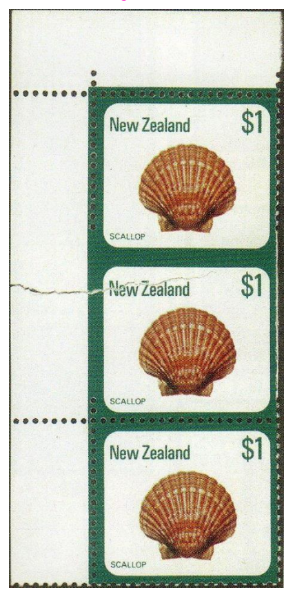
Sixth Pictorial Issue – Scallop – 1975-81

Between 1975 and 1981, New Zealand Post issued a definitive set of twenty-one stamps (1c to $5) depicting a variety of pictorials ranging from roses and artefacts to shells. Six stamps depicting shells were issued (20c, 30c, 40c, 50c, $1 and $2). The stamps were designed by I. Hulse and printed by Heraclio Fournier, Spain using photogravure in panes of 100 stamps per pane. The $1 stamp (issued on November 26, 1979) depicts the Scallop shell. The error on this $1 stamp was described in the auction catalogue as: