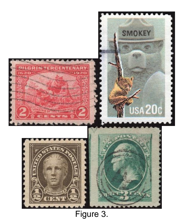
example is see at the lower right. It is a center margin copy that was not perforated on that margin. Boardwalk margin stamps must be perforated on all four sides.

Only slightly more available are very wide margins such as in Figure 4, or miscuts across sheet divider lines caused by misperforation, as shown in Figure 5.