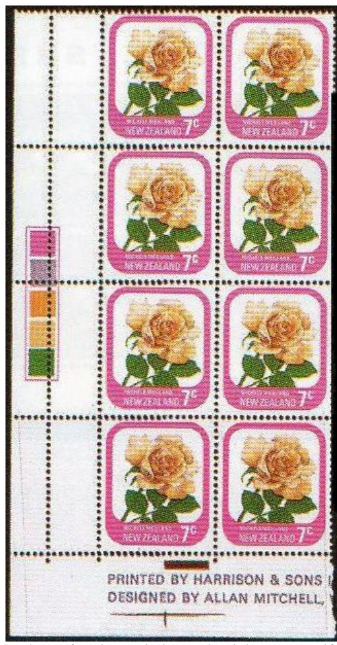
[Editor's Note: The perforations missing at the right are an artifact of the scan and exist in the actual stamps.]

Between 1975 and 1981, New Zealand Post issued a definitive set of twenty-one stamps (1c to $5) depicting a variety of pictorials ranging from roses and artefacts to shells. Nine stamps depicting roses were issued (1c, 2c, 3c, 4c, 5c, 6c, 7c, 8c and 9c). The stamps were designed by A. G. Mitchell and printed by Harrison and Sons, England using photogravure in panes of 100 stamps per pane. The 7c stamp (issued on November 26, 1975) depicts the rose – Michele Meilland. The error on this 7c stamp was described in the auction catalogue