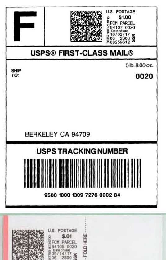
Above: Parcel Stamps issued after service renamed from "First Class Mail Parcel Service" (FCM PARCEL) to "First Class Package Service" (FC PKG RTL). Stamps still show old designation.

Defunct service or rate kiosk stamps are among the most important kiosk errors, because the kiosks so rarely issue stamps for defunct services or rates. If you have any of these error stamps, please let me know what you have. 😂